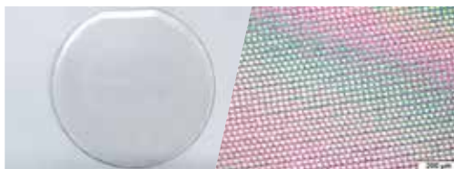
sapphire GaN lift off